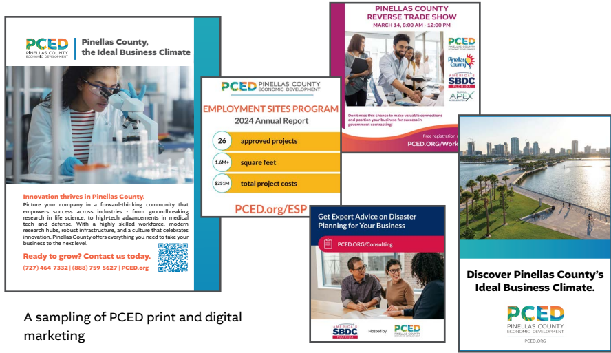
A sampling of PCED print and digital marketing

PCED successfully amplified Pinellas County’s reputation as “The Ideal Business Climate” by leveraging high-profile corporate successes and strategic program performance, primarily showcased through the ESP and major business expansion announcements. The strategy concentrated on translating economic wins into compelling narratives for national site selectors and local stakeholders. Key highlights include success stories and press releases which generated earned media surrounding the expansions of AGORA Edge (November 2024), Florida Seating (February 2025), and the grand opening of Astaras’s new tungsten steel business unit (August 2025). We further amplified these wins by creating three new short-form testimonial videos. These corporate successes allowed PCED to showcase the concrete impact of Penny for Pinellas funding on industrial space redevelopment and connect the creation of high-wage jobs to the county’s desirable talent pipeline and livability.