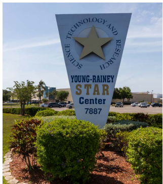
STAR Center signage

A $250,000 Defense Reinvestment Grant from FloridaCommerce will help fund the creation of redevelopment specifications for the Young-Rainey STAR Center. In alignment with the Pinellas County Board of County Commissioners’ goal for prosperity and growth, PCED advanced a redevelopment plan and Request for Negotiations focused on modernizing facilities, retaining current tenants, and attracting new, high-wage employers.