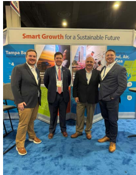
PCED staff represented Global Tampa Bay at the SelectUSA Investment Summit