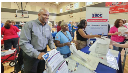
Florida SBDC at PCED staff hosted a booth at the Pinellas County Hurricane Preparedness event, dispensing critical business disaster planning information

The Florida Small Business Development Center at PCED was proud to help clients secure more than $19 million in capital to support and grow their businesses. Our Small Business Enterprise (SBE) program awarded over $52.4 million in contracts to local businesses. In partnership with the Florida APEX Accelerator program, we guided business owners in securing an additional $41 million in federal contract awards. The annual Pinellas County Reverse Trade Show connected 265 local small business owners with procurement officials to expand contracting opportunities, and a new Business Succession Incubator was launched in partnership with St. Petersburg College and the Bay Area Manufacturers Association.