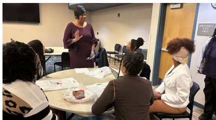
PCED partnered with Pinellas County Schools to host the High School Pitch Competition, in which students presented their business ideas to local industry leaders