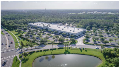
Project completed in May 2025

utilized the ESP to expand with a new, 86,350-square-foot manufacturing facility in Pinellas Park. The building can hold an