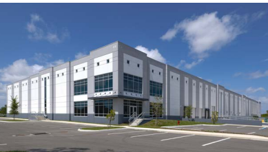
Project completed in November 2024

estimated 190 manufacturing employees and the project will help create more higher-paying manufacturing jobs and encourage additional economic activity through the purchase of ancillary products and services.