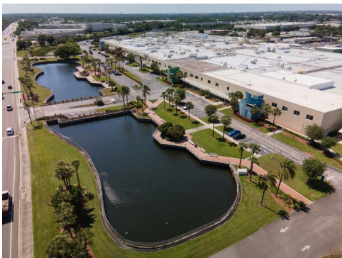
Aerial view of STAR Center